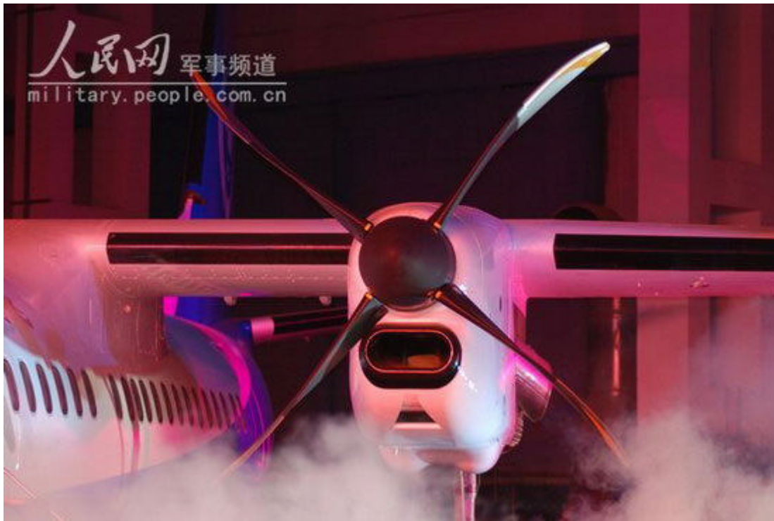
Turbo-prop passenger aircraft "Xinzhou"

Xinzhou-600, a proprietary new generation turbo-prop passenger aircraft for regional flights made its debut on June 29, 2008 in Xi'an. As a latest model in Xinzhou series designed and manufactured by Xi'an Aircraft Industry Group, the new aircraft enjoys numerous merits, including reduced cost and fuel consumption. Unlike strict requirements a jet may have on runways, Xinzhou-600 is able to take off on a runway as short as 1200-2000m, and is allowed to take off and land on a runway made up of earth and sands, or even on a snow-covered runway.