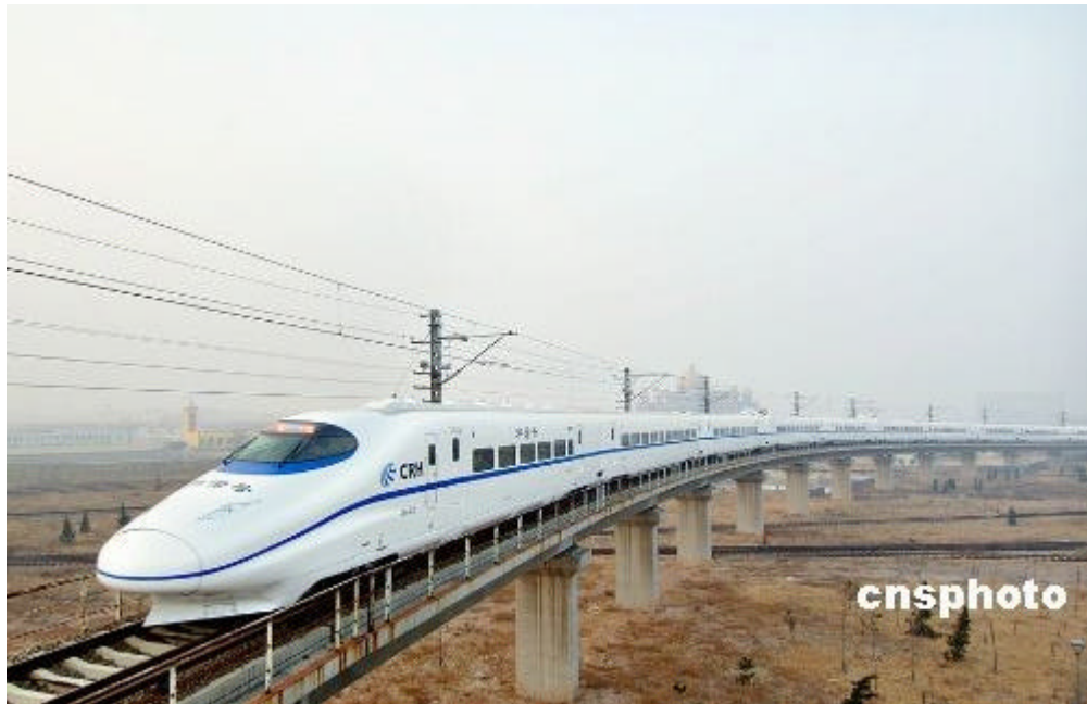
A super long train made up of 16 compartment cars

A Chinese made super long train consisting of 16 compartment cars rolled off the assembly line at the Nanche Sifang Locomotive on June 29, 2008. Designed to run at a speed of 200-250km, the locomotive is a novel model applied with a range of state-of-the-art technologies, including a light aluminum alloy body, high speed bogie, high speed pantograph, and an integrated optic-fiber control network. Made up of 3 first-class compartment cars, 12 second-class compartment cars, and 1 dining car, the train is able to carry 1,230 passengers, doubled the number that an 8-compartment train can carry. Meanwhile, the train is equipped with new functionalities, including dining car, multimedia system, highly advanced ventilation system, and emergency ventilation system, to allow an enhanced comfortableness and entertainment. The new train has demonstrated an improved stability in a high speed operation, thanks to the advanced technologies used, including a semi-active suspension system, and coupled car-end dampers.