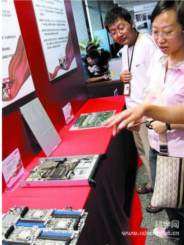
Shuguang series products

Institute of Computing Technology under the Chinese Academy of Sciences, Shuguang Server, and Shanghai Supercomputing Center jointly signed on June 24, 2008 an agreement in Beijing to make Shanghai the home to Shuguang-5000 supercomputer. The effort will make Shanghai Supercomputing Center the largest commercial computing platform in the world. In addition to a capacity of 200 trillion floating-point operations per second, Shuguang-5000 supercomputer enjoys other strength, including proprietary design, super density, best cost/effect ratio, lowest energy consumption, and broadened applications. The new supercomputer also witnesses greatly enhanced performance in size, energy efficiency, software efficiency, and management. It produces a performance 20 times better compared with 4000A, with a size 2/3 of the latter, and an increased energy consumption by only 50%.