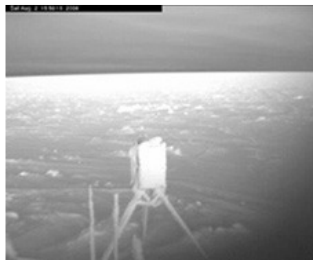
Winter observation at the Dome A (August 2, 2008)

CSTAR, jointly developed by the Nanjing Institute of Astronomic Optics, the Purple Mountain Observatory, and the National Astronomic Observatories, all affiliated to the Chinese Academy of Sciences, was installed January 12, 2008 on the DOME A, an Antarctic plateau. It sent back on March 20, 2008 a clear star picture, and started to make observation. As of August 2, 2008, the telescope has been making observation for 135 days, including the winter time observation at the DOME A. It has recorded and sent back numerous star pictures surrounding the area, which have been turned into consecutive optic variation curves. Scientists have found a range of variable stars, and collected important information on site selection, including the number of consecutive clear nights, sky luminance, and cloud cover at the DOME A through the observation.