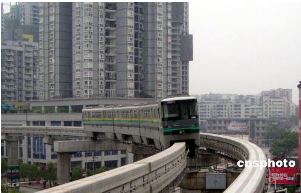
Test run of straddle monorail transit vehicle in Chongqing.

The Chinese Ministry of Science and Technology (MOST) kicked off on February 26, 2008 an R&D project in Chongqing to work on the key technologies needed for establishing a straddle monorail transit system in the city. As an initiative under the National S&T Support Program for the 11th Five-year period (2006-2010), the project will work on 10 research missions, including industrialized manufacture of monorail vehicles, support facilities for a monorail transit system, and monorail transit safety. It is supposed to produce the said ten