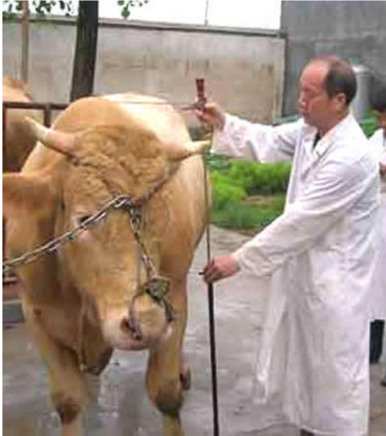
Measuring a Xianan crossbred.

Not long ago, China National Committee on Genetic Resources of Domestic Animal has identified Xianan crossbreds China's first beef species. The new species, grown in the Miyang County, Henan Province, is crossbred with French Charolais, using the genes extracted from Nanyang beef in the locality.